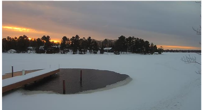
5Lac la Belle February 1, 2021