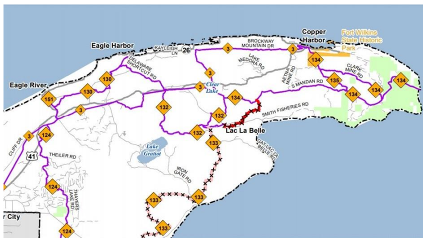
3Map courtesy of the Michigan Department of Natural Resources

All other trails are open to pedestrian and bicycle traffic, as well as berry pickers and foragers.