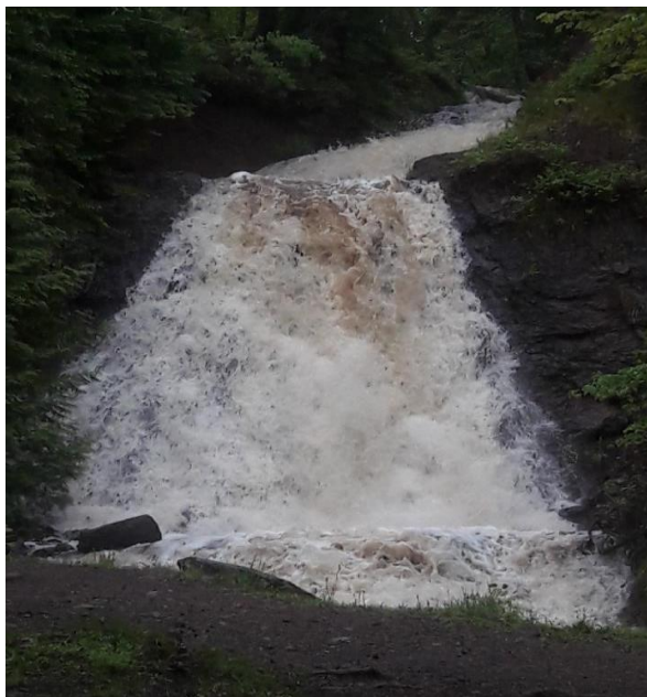
Haven Falls during Tropical Storm Cristobal

Mother Nature hit the South Shore hard in 2020. Between the COVID-19 virus and restrictions on travel, gatherings and small businesses, fewer of us were able to gather and enjoy each other's company. Dumpster Days survived and the Fire Department Fish Boil became a pickup and take it away event.